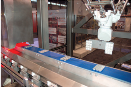
Integratable with Automatic Robotic Loading