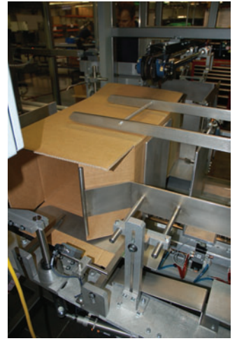
Positive Case Control