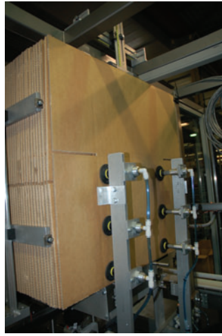
Reciprocating Case Feeder