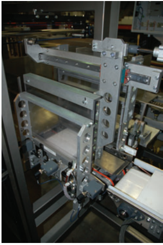
Servo Driven Upstacker