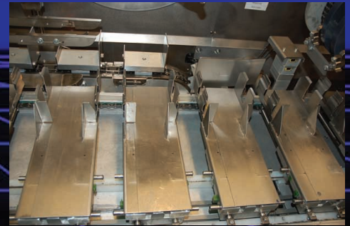
ZAC Patented Dynamic Product Buckets for Maximum Product Control