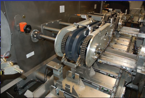
Single or Double Infeed System